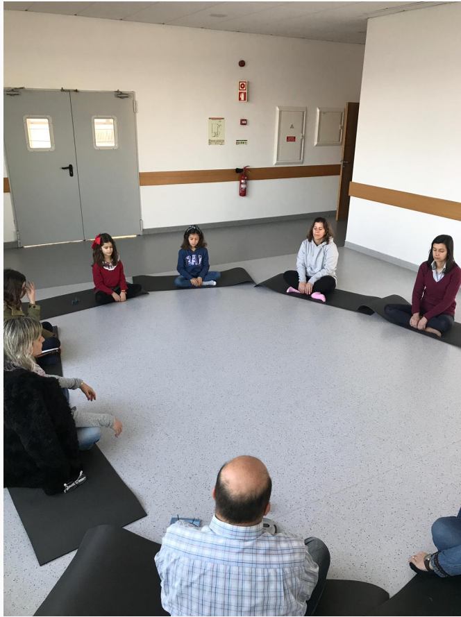
Meditation teachers and families