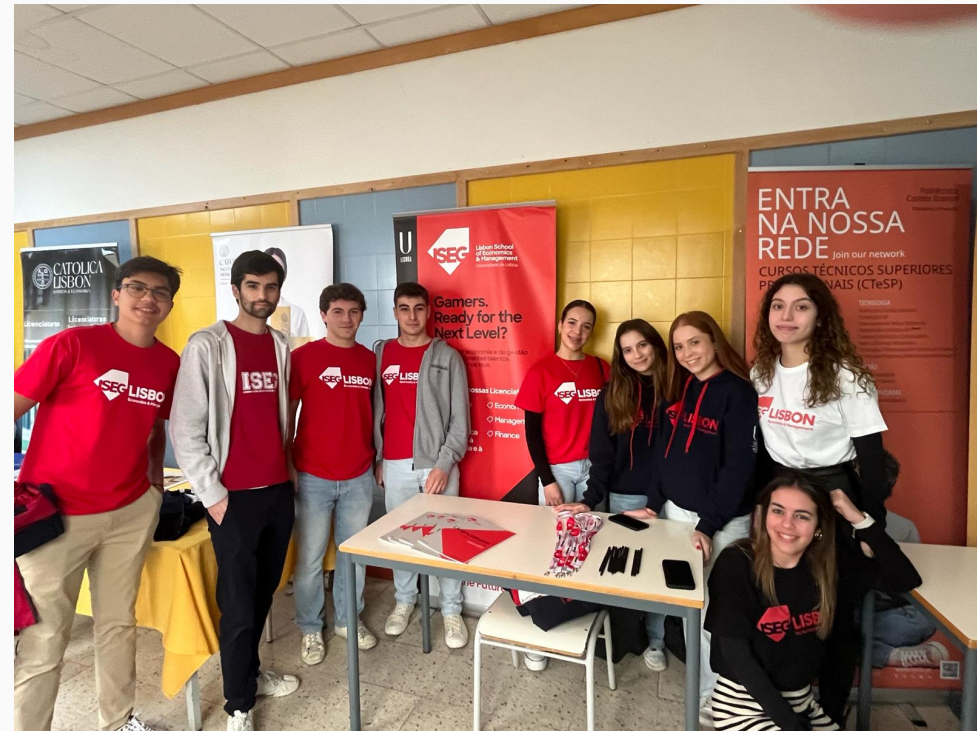
Former students visit us to promote their faculties